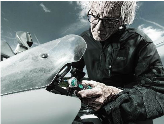
Kompakt - auch für die Hosentasche gedacht.jpg

Perfect compact tool set - even when you're out and about.