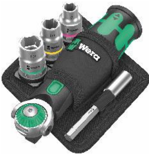
In praktischen Sets sicher verstaut.jpg

The Zyklop Pocket sets 2: 12 bits, 3 sockets, 1 universal holder (75 mm long) and 1 robust textile holster for the belt and to be docked onto the Wera 2go system.