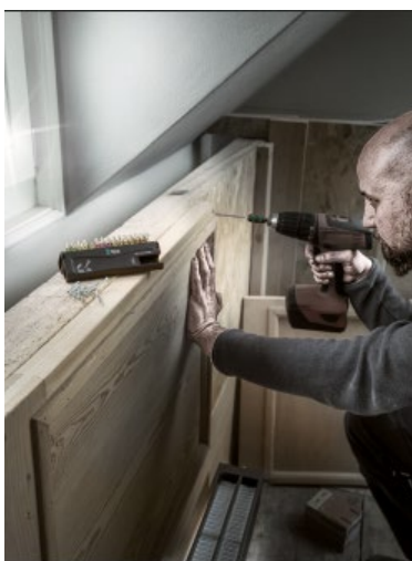
Barking up the wrong tree can be fun.