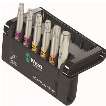
The 6-piece Bit-Check 6 Wood TX HF.